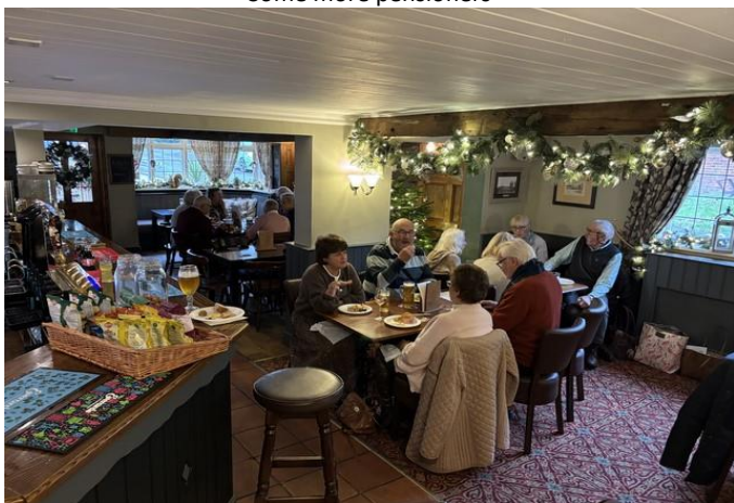
Yet more pensioners