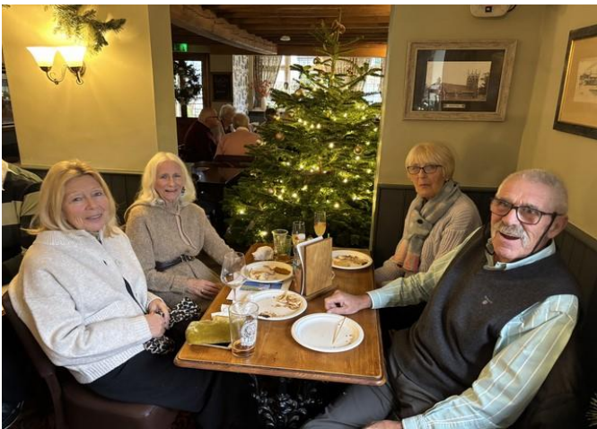
Some more pensioners

30 pensioners from the village (60s and over) gathered together in The Dog and Gun on Tuesday 10 th December. Much more informal than past events but probably more sociable as those attending freely mingled and chatted with friends and neighbours.