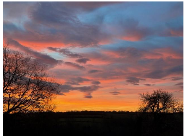
December Sunrise