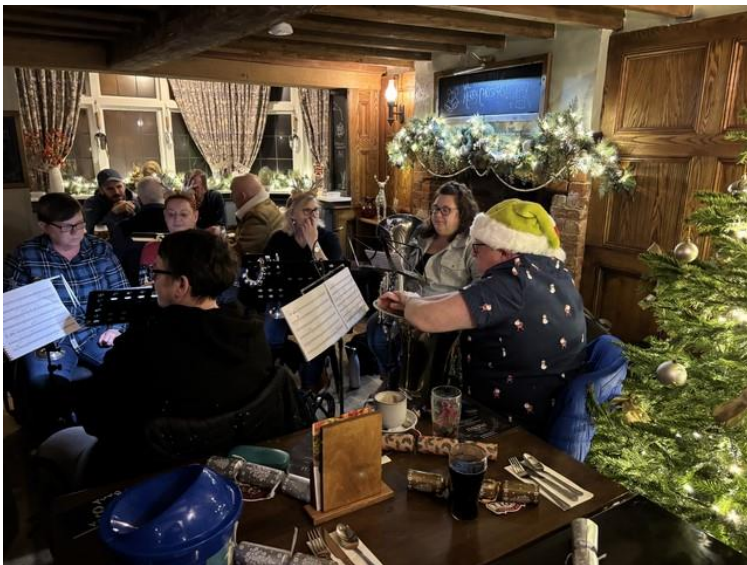
Syston Brass Band Christmas Carols and Festive Tunes at the Dog and Gun