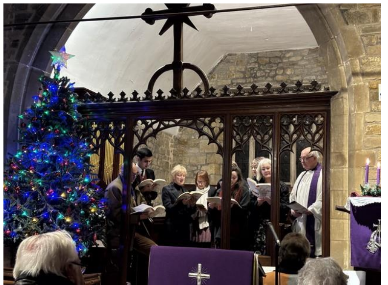
The choir at the Carol Service